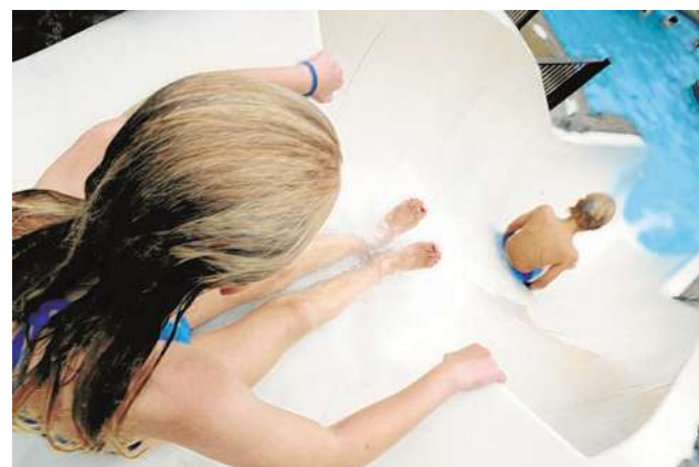
Slide into fun at the Grand Geneva pool.