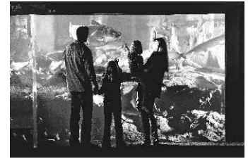
The newly renovated National Mississippi River Museum has new aquarium, interactive exhibits and a 4D theater.

River Museum completed a $40 million expansion meaning you can explore six large aquariums, interactive exhibits and a 4D theater all under one roof. The new 40,000-gallon aquarium is the largest in Iowa and its swimming sharks and eels are sure to get a "whoa" out of the kids. They'll say "sweet" when you take in breathtaking views from world's steepest and shortest scenic railways. For only $2 per passenger, jump on the historic Fenelon Place Elevator (est. 1882). Stroll in the crisp, autumn air along the beautiful River Walk before heading back to your digs at Grand Harbor Resort and Waterpark. Family of four packages start at $134 and include deluxe room accommodations, indoor water park tickets, complimentary breakfast and a free pizza from Tony Roma's. Point the van west and see "The Field of Dreams" movie site in Dyersville and a