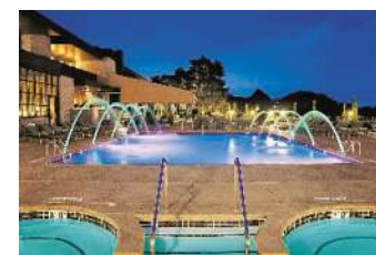
The Grand Geneva pool at night is a beautiful sight.

Got kids? Gotta have a pool and the resort offers indoor and outdoor swimming pools, including a Water Playground with a 70-foot waterslide, floating obstacle course, zero-depth sprayground, basketball hoops and more. Practice your backhand on indoor and outdoor tennis courts or hit the links on three championship golf courses, including The Bear, designed by golf legend Jack Nicklaus; sign up for a family golf lesson. Team up for beach volleyball and don't miss the bonfire, complete with singalong and s'mores. Every Friday and Saturday night from 6 to 10 p.m. the 6- to 12-year-olds can compete in wacky games, swim, get into arts and crafts and join in a pizza party during the “Kid's Night Out” program. Meanwhile, you're at Spa Grand Traverse enjoying hydrotherapy, body wraps, massages, facials, manicures and pedicures. Maintain your fitness goals at the Health Club's fully equipped cardio and weight rooms, fitness classes and indoor pool. Have a date night dinner and regroup later for in-room Nintendo and movie rental options. Teens