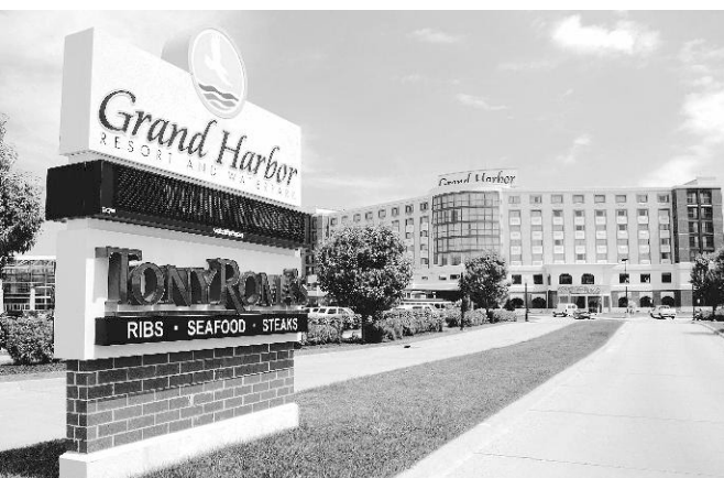
The Grand Harbor Resort and Waterpark is a great family destination.

fieldofdreamsmoviesite.com/distance.html . Free admission and open through Nov. 30.