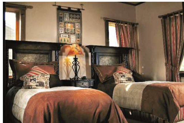
The Stonewater Cove Resort and Club has a rustic elegance — the perfect destination for a long weekend away.

How about a weekend in Africa by way of I-90? The Fall 3-Night Savings package available at