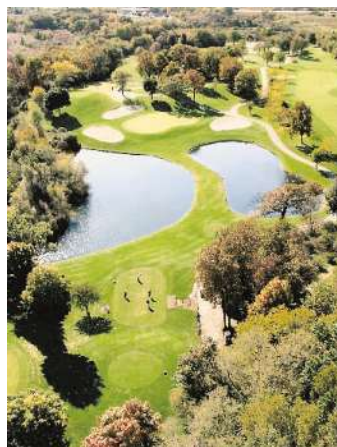
Hit the links at the Grand Geneva Resort and Spa.

young gourmets ordering tekka maki minus the tobiko (flying fish roe) and saving room for the house creme brulee. Sign up for the Ultimate Desert Creation for children of all ages: for around $10, kids and adults work in the restaurant kitchen with a pastry chef who takes them through a step-by-step process of creating and plating a fabulous dessert. Have the staff refrigerate the work of edible art and your young Wolfgang Pucks can enjoy it later as dessert in one of the resort's restaurants.