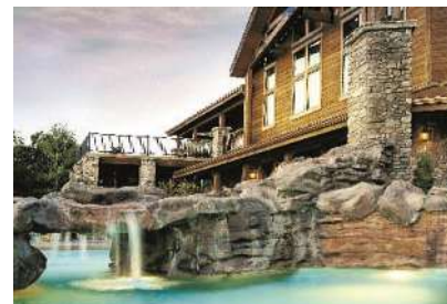
Enjoy the Ozarks in autumn at the Stonewater Cove Resort and Club.