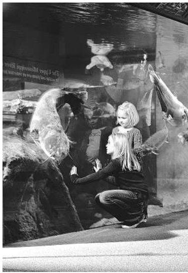
One of the six large aquariums at the National Mississippi River Museum.

The only full-service resort right on Lake Geneva, the Abbey Resort & Spa in Fontana,