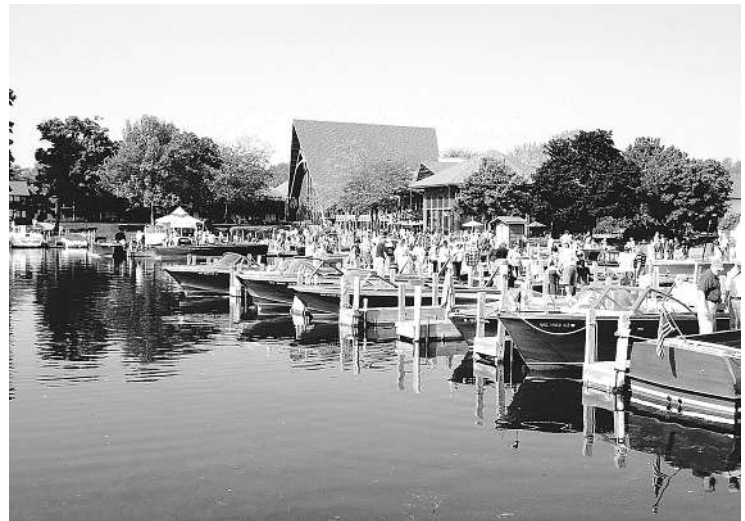
Time a trip to The Abbey Resort & Spa to coincide with the Antique and Classic Boat Show.

meal at Iowa's oldest bar and restaurant, Breitbach's Country Restaurant (est. 1852), is a must. Serving old-fashioned American comfort foods, Breitbach's is antique-filled and offers magnificent views of the Mississippi and family-friendly prices.